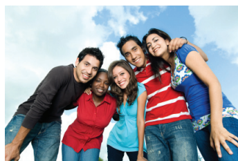
Youth & Young Adults

HCV's healthy beverage, food and snack vending units appeal to a broad demographic which include a diversity that is unlimited.